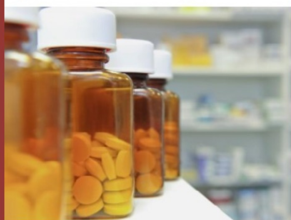
Pregabalin has until now only been available for prescription in a branded form called Lyrica

Katie Forster Health Correspondent | @katieforster | 6 days ago | 42 comments