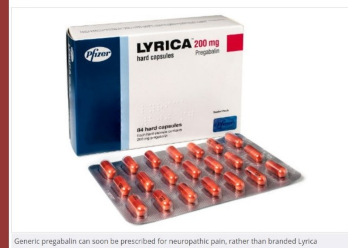
Generic pregabalin can soon be prescribed for neuropathic pain, rather than branded Lyrica

by Annabelle Collins | 23/06/2017 | 2 comments | News